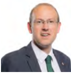
Llyr Gruffydd AM

Welsh Conservative Preseli Pembrokeshire